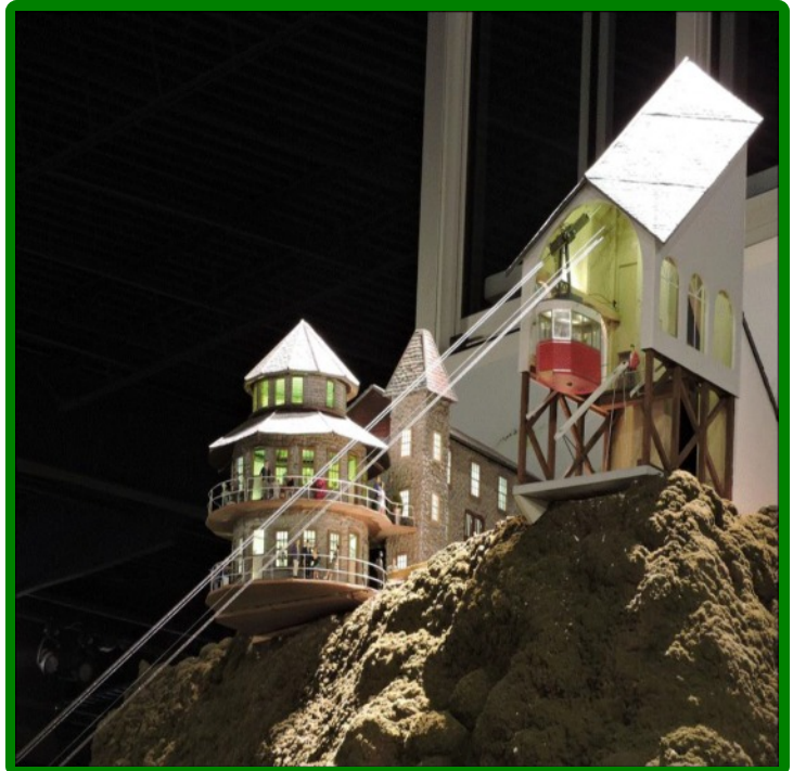
Figure 1. Destination for Aerial Tram Customers

Figure 2 shows the restaurant at its final location, where it can be better seen and appreciated from a number of different locations on the EJ layout, as we'll see in the following. The photographs in Figures 2 and 3 were taken from the EJ aisle near the Middle City's drive-in soda stand. Both photographs were taken during the period of EJ's "daylight" lighting. Some adjustments in the daylight spotlighting will be needed to give the restaurant its proper due.