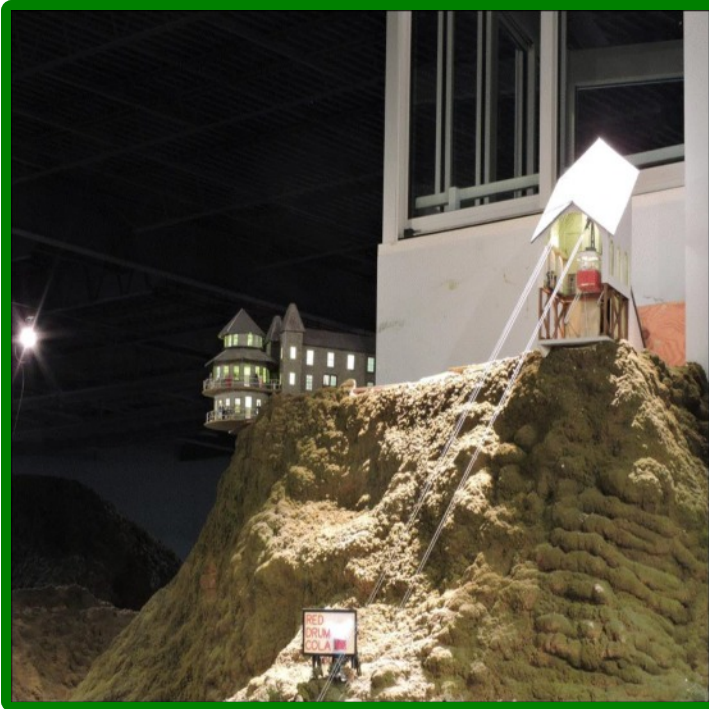
Figure 2. Cliff-Top Restaurant and Upper Aerial Tramway Station

For the Complete Big train Project Status Report 155 please visit mvgrs.com