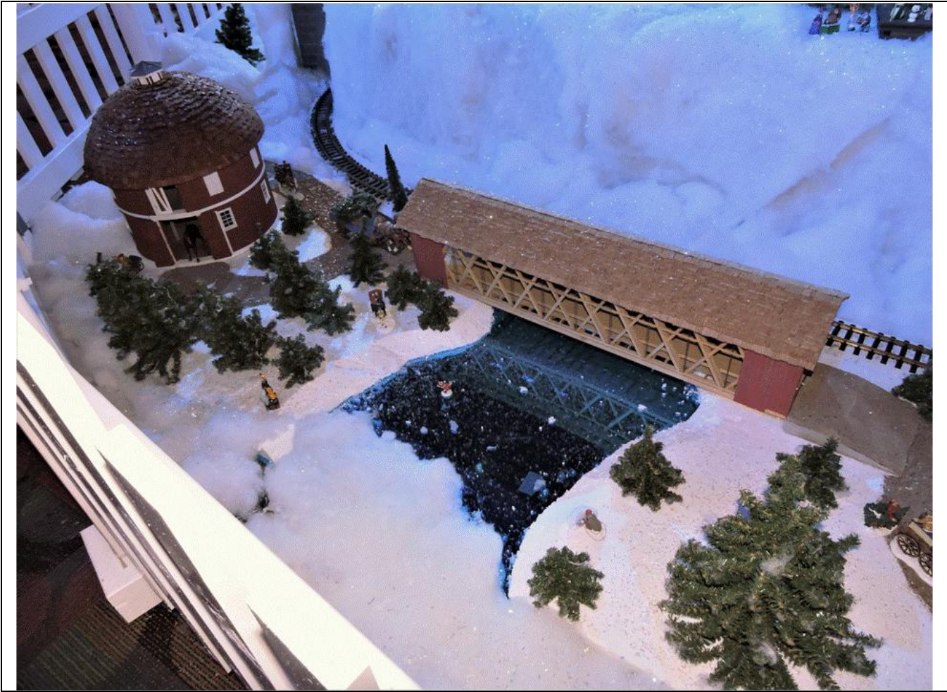
Figure 3. Round Barn and Covered Bridge

Among the many models on the Christmas layout, two are especially noteworthy because of their beauty and their exquisite detail: the round barn and the open-framework covered bridge shown in Figure 3.