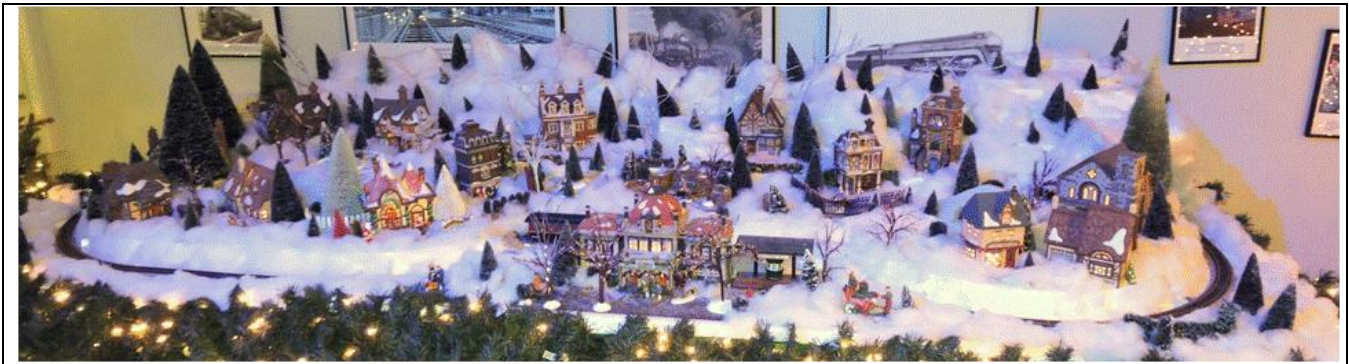
Figure 6. Christmas Village

There's a Christmas Village with lighted buildings and a train running around it, again at the push of a button (Figure 6).