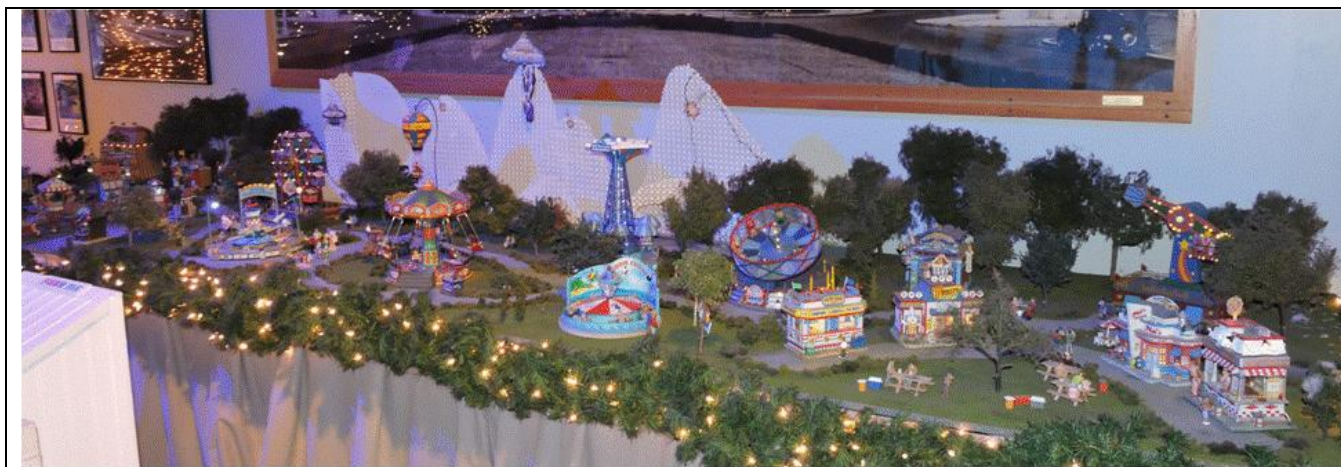
Figure 5. Miniature Amusement Park Model

A miniature amusement park has all kinds of operating rides, which can be activated with the push of a button (Figure 5).