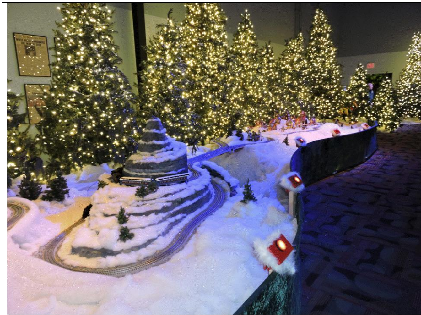
Figure 4. O-Gauge Christmas Layout

Even with all that is to see on the main layout, there is still more to enjoy. A long O-gauge layout has multiple-loops of track and holiday scenes inside each loop (Figure 4). The lighted buttons along the edge of the layout are for activating the trains on the various loops.