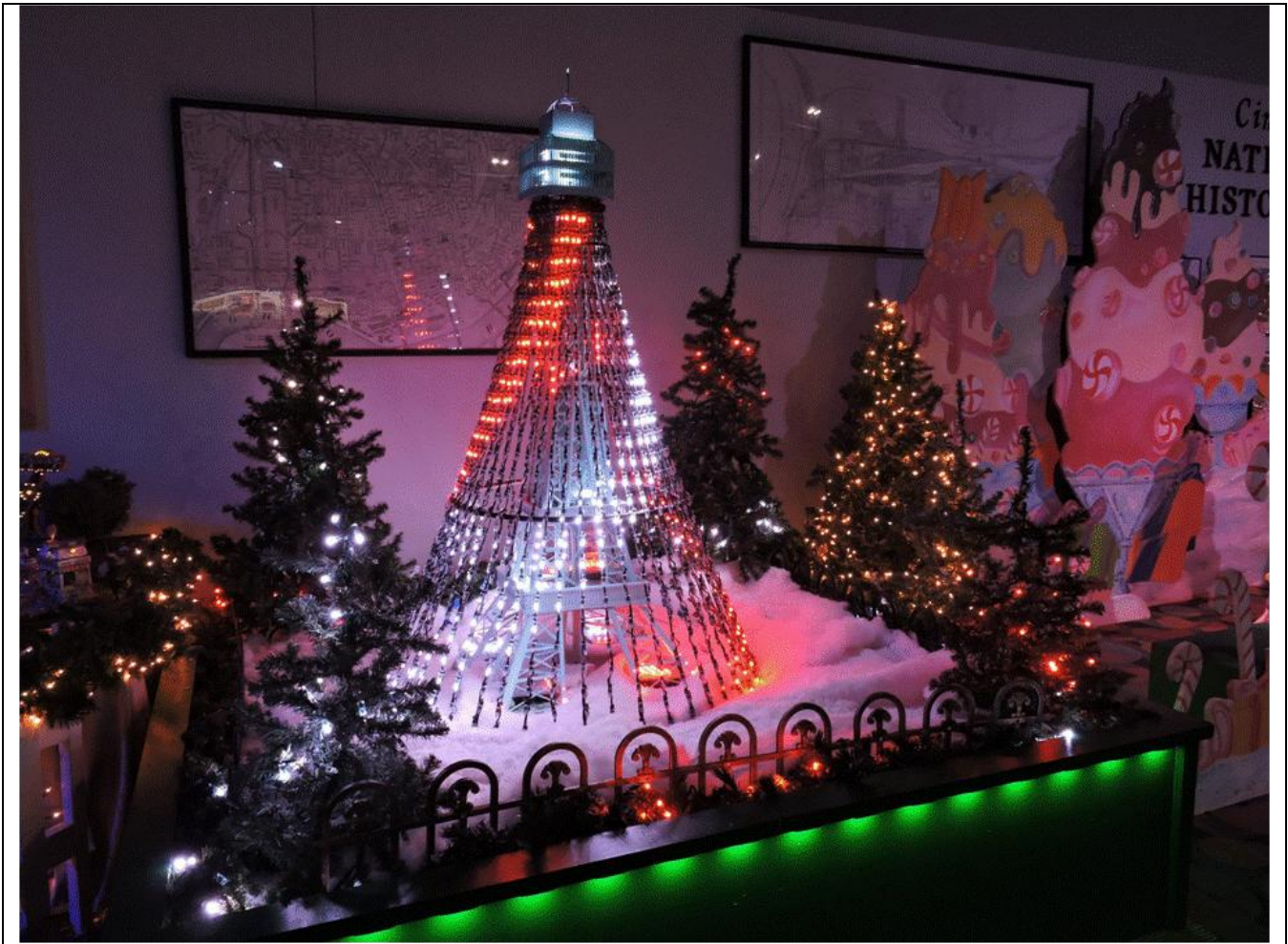
Figure 8. Dancing Lights on an Eifel Tower Model

And finally, but by no means least, a mesmerizing lighted replica of King's Island's Eifel Tower has lights that play different moving patterns in time with the Christmas music that plays throughout EJ during the Christmas holiday season (Figure 8).