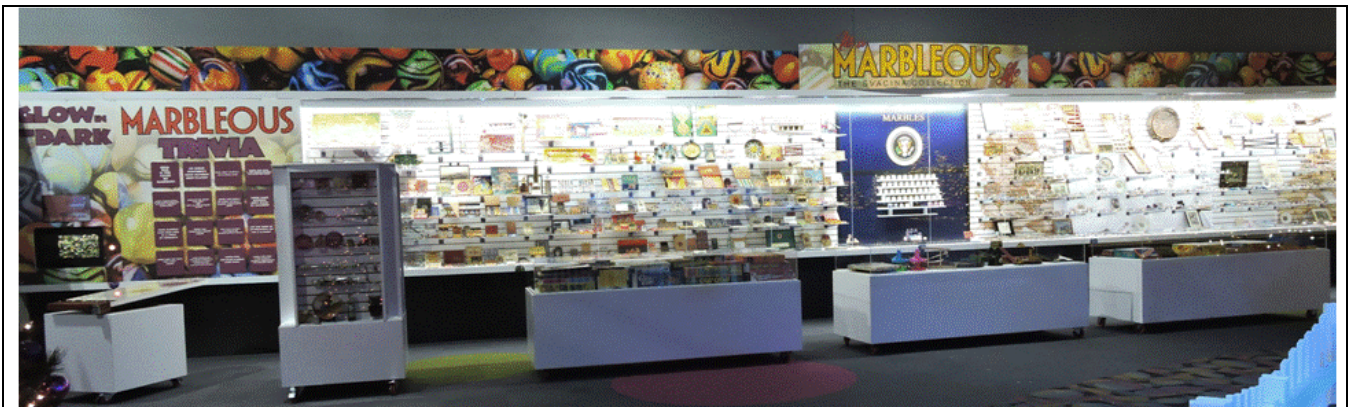
Figure 7. Marbleous Museum

The spectacular “Marbleous” Museum of all things marbles, a permanent exhibit at EJ which is normally accessible only with a paid admission to the EJ layout, is free to the public during the Christmas season as part of the Christmas holiday display (Figure7).