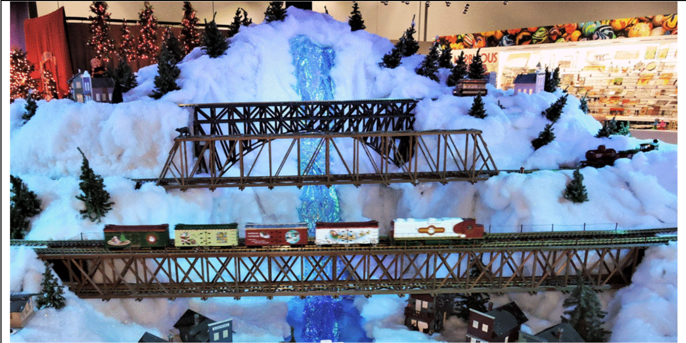
Figure 2. Christmas Layout Bridge Detail

The lowest of the three bridges in Figure 2 is about 8 feet long and supports two tracks on its upper level and a single track on the lower level inside the truss structure.