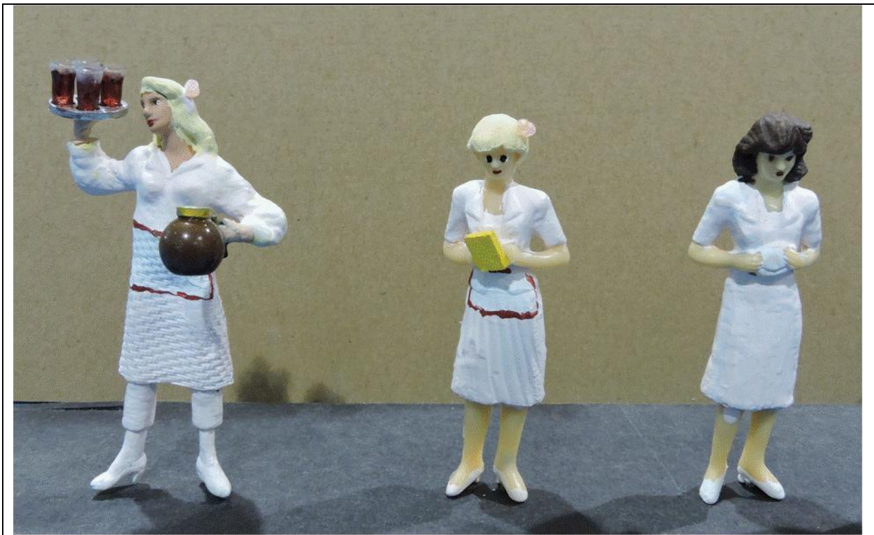
Figure 2. The Wait Staff

The customer service staff consists of two waitresses and a cashier, shown left to right in Figure 2. The pants showing below the skirt of the waitress at the left were leftovers from her original as-manufactured outfit. They are, of course not appropriate for the time period of the diner (~1946), but grinding them off the plastic figure was unnecessary since her legs would not be visible from anywhere accessible to EJ customers. This particular model was chosen because she had arms that could be modified to the positions desired. Even so, new hands had to be created to enable her to hold the tray and coffee pot. The other waitress (center) has her yellow order pad at the ready to write down customers' orders. The cashier required only a new paint job for her uniform, since her hands will not be visible to EJ customers.