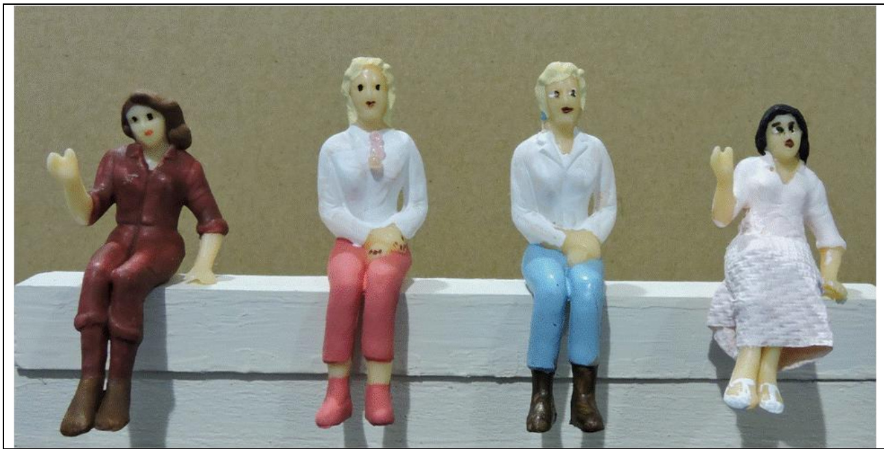
Figure 4. Sitting Female Customers

A number of sitting female customers were needed. Figure 4 shows a representative sample. Even though pants for ladies were not appropriate for the time period and location, they will not be visible when these ladies are positioned in the diner's booths, and so only their upper halves needed to be correct. The lady on the right had a skirt applied, so it would be appropriate for her to sit somewhere where the skirt would be visible to EJ customers.