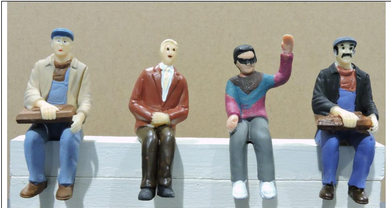
Figure 5. Sitting Male Customers

A variety of character types are represented by the men in Figure 5. Even though the two at the ends of the Figure 5 are the same model, their different facial features and clothing set them apart. The briefcases will not be visible when they're sitting in the diner's booths.