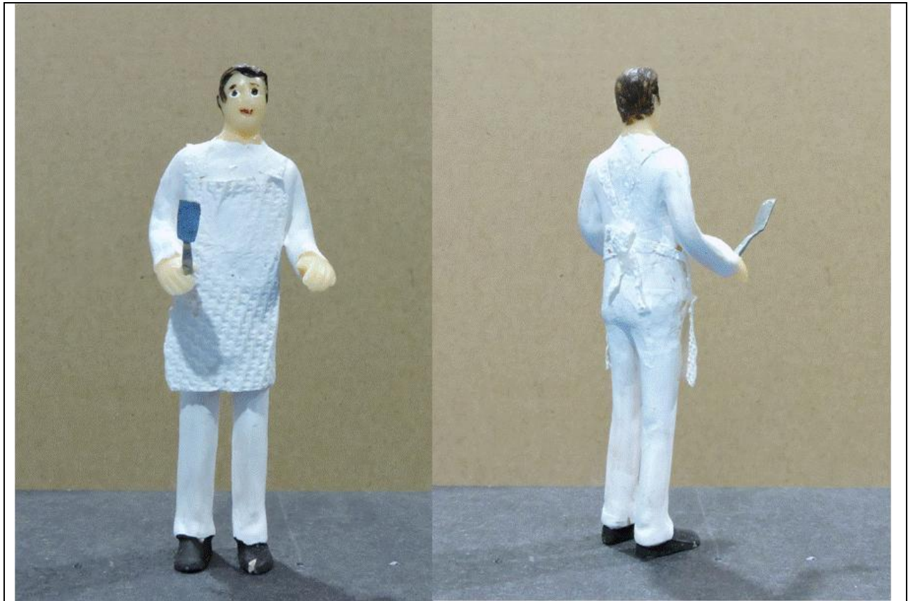
Figure 1 The Cook

Since the cooking area is at the back wall of the dining area, the model needs a visible short-order cook, with a (hopefully clean) white uniform, an apron, and a spatula in hand (Figure 1).