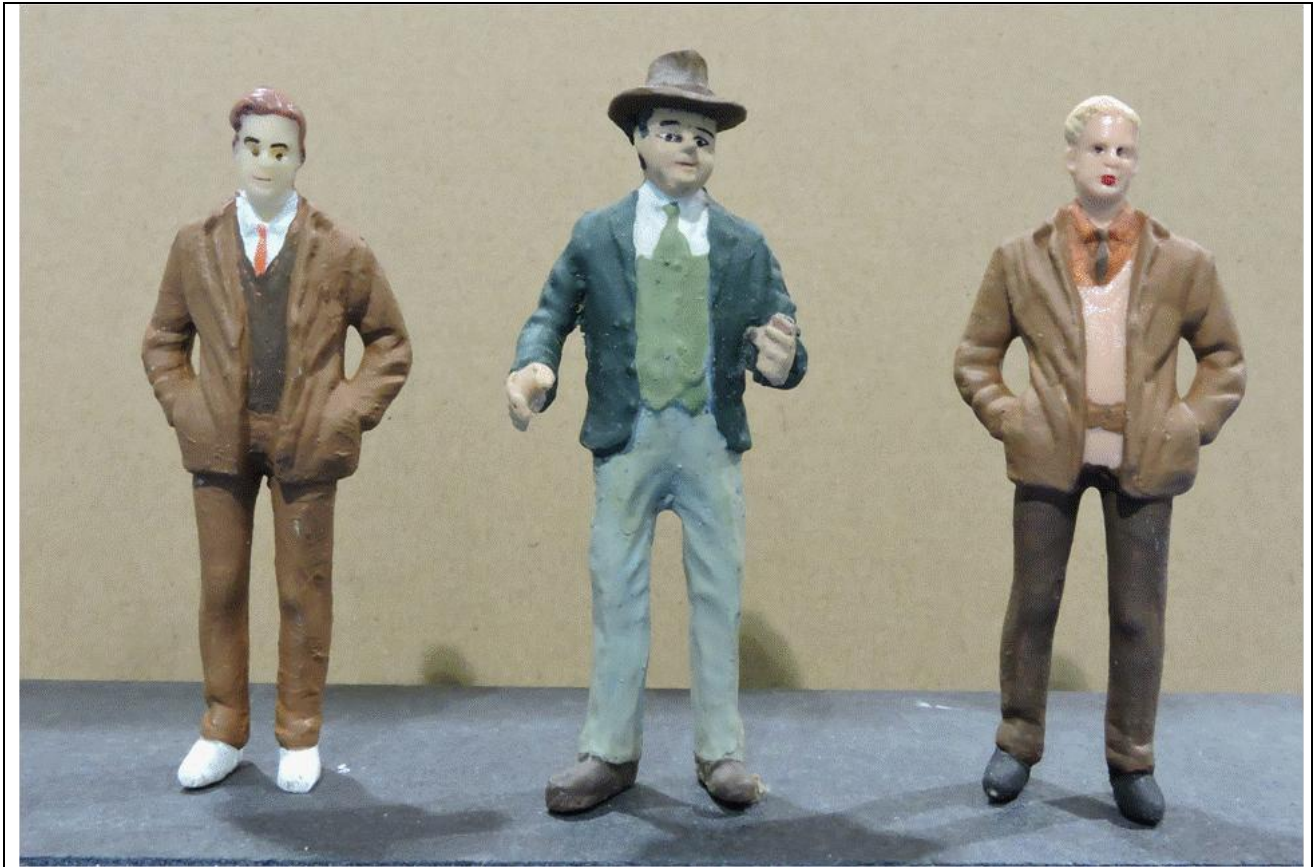
Figure 3. Standing Male Customers

Not too many standing male customers were needed, but a few would add some interest (Figure 3). The man with the hat looked just right as a customer paying his bill at the cashier.