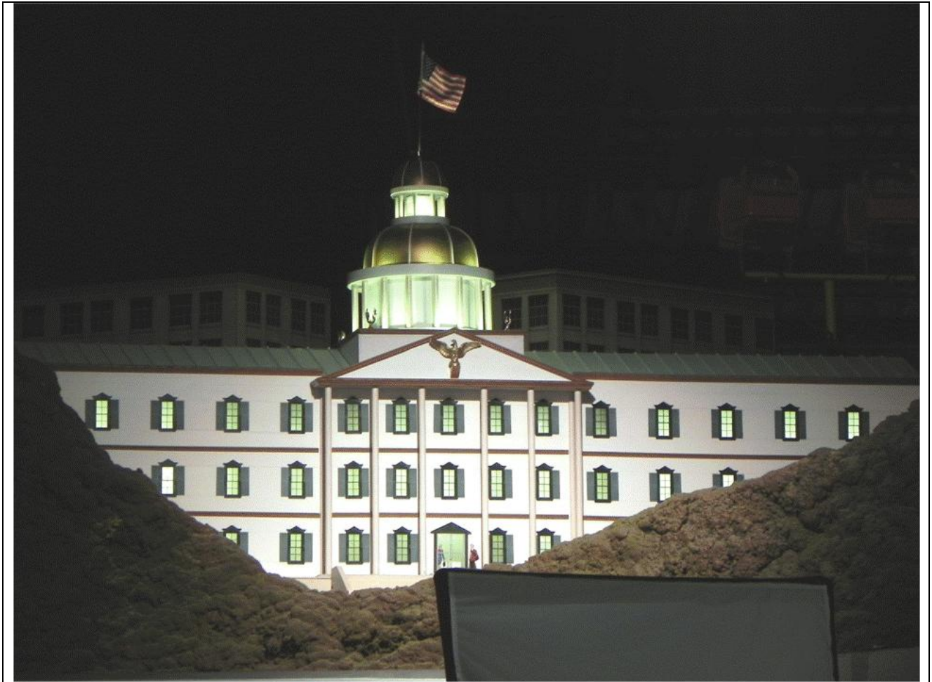
Figure 6. In the hills behind the Modern City, 30 Dec 2012

Its fifth location as well as its current (seventh) location are in the same place, overlooking the Modern City from the hills above the aisle tunnel where the layout transitions from the Middle Period to the Modern Period. In this last location, it sits atop an elevated platform so that more of it is visible in the gap in the hills (Figure 6).