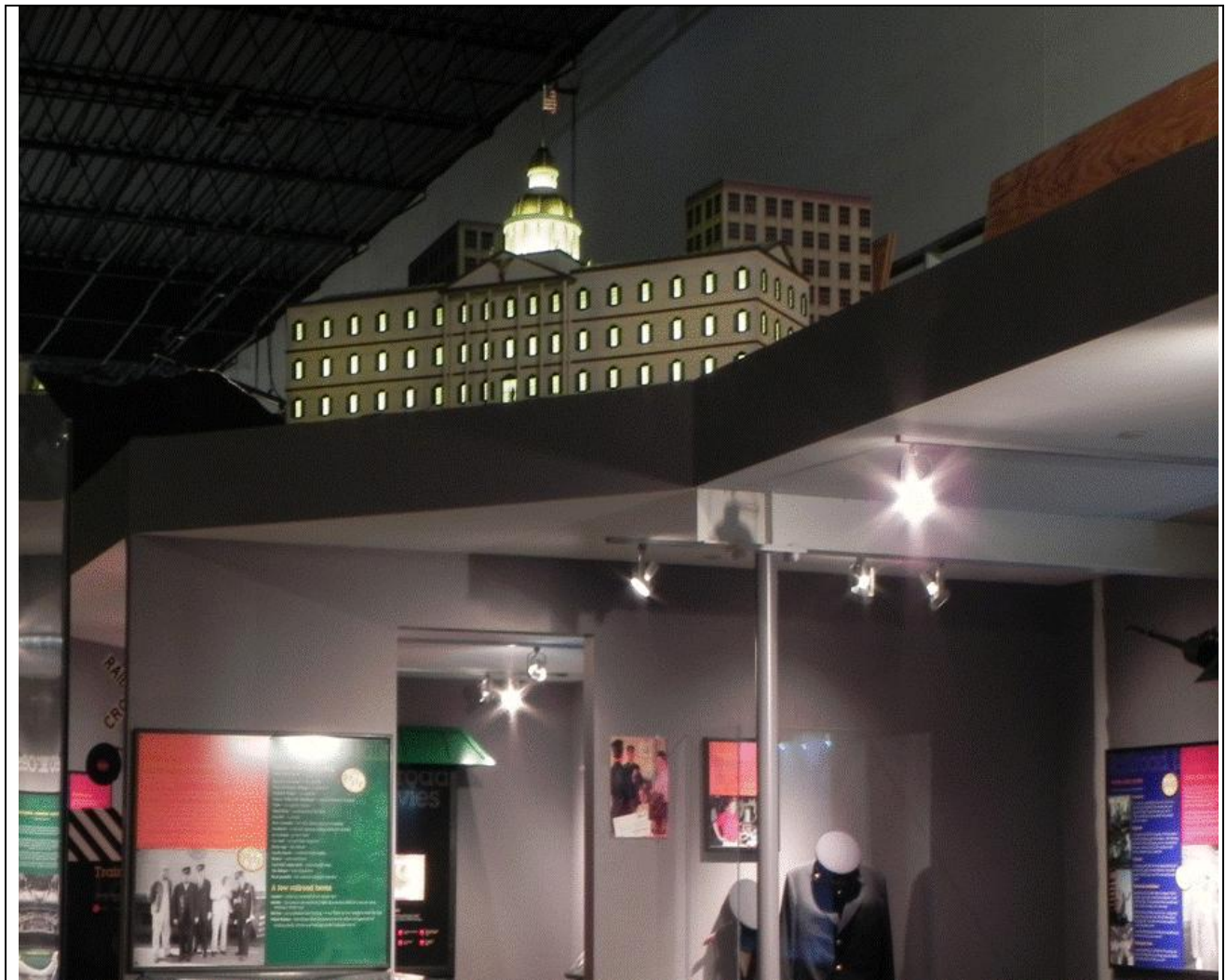
Figure 5. On the mezzanine across from the roundhouse, 19 Mar 2012

The Capitol Building was placed in its current location (see Figure 6) for a while, but when work was started preparing the mezzanine for scenery, there was an opportunity to provide it some better and more complete exposure by temporarily installing it on the mezzanine at the end closest to the aisle tunnel leading to the Modern Period of the layout (Figure 5).