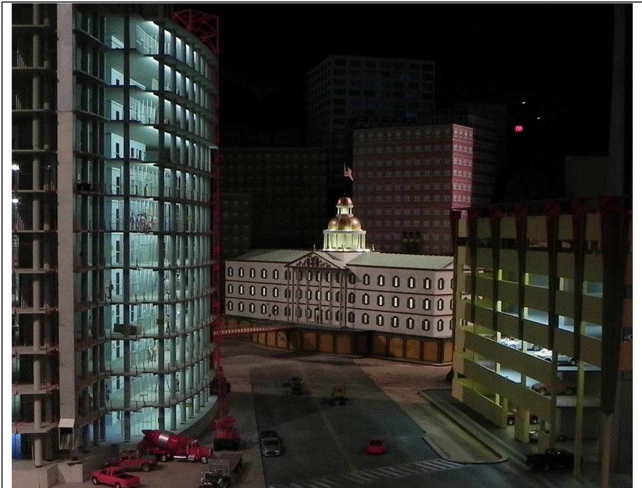
Figure 4. Back in the Modern City, now on a raised platform, 28 Feb 2011

With the upgrade complete, the Capitol was installed again in the Modern City at the meeting of all of the streets in the city's center (Figure 4). Unfortunately, that installation was short-lived, as this building was replaced by a newly constructed baroque-like domed building, which provided a curious architectural counterpoint to the modern style of all of the other buildings in the Modern City.