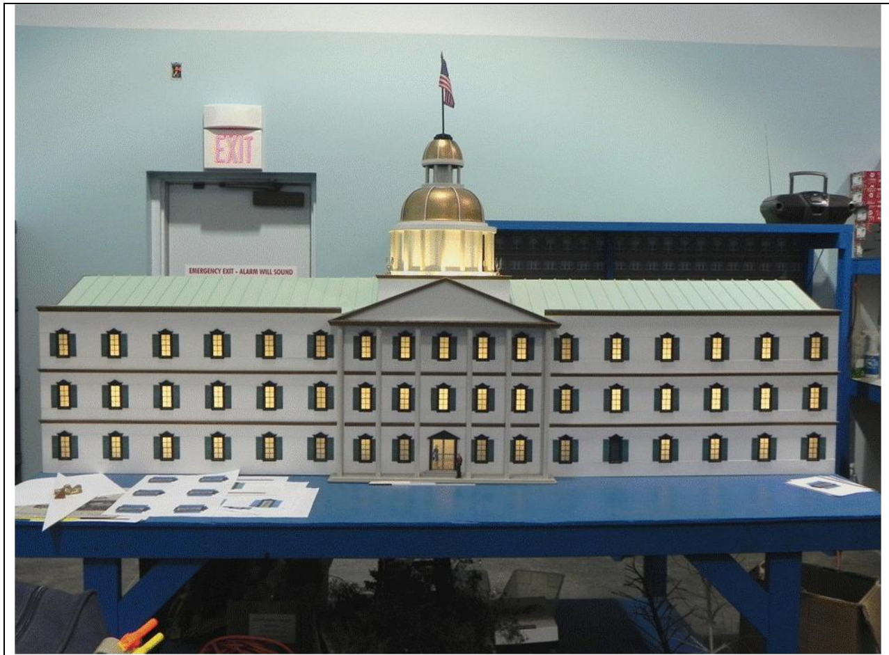
Figure 3. In the EJ workshop for upgrading, 21 Feb 2011

In the latter part of 2010, the Modern City underwent a major renovation. When finished, gone were the sloping streets and the foreground buildings made of Gatorboard with printed façades. They were replaced by new modern skyscrapers with interiors and lighting. That prompted a major renovation of the Capitol Building as well. Added mouldings, new roof detail, interior lighting, and lighting for the dome and flag greatly improved its appearance. The lighting was added to enhance the look for the day-dusk lighting cycle being planned for the entire layout. The building spent a few weeks on a table in the EJ workshop getting its upgrade (Figure 3).