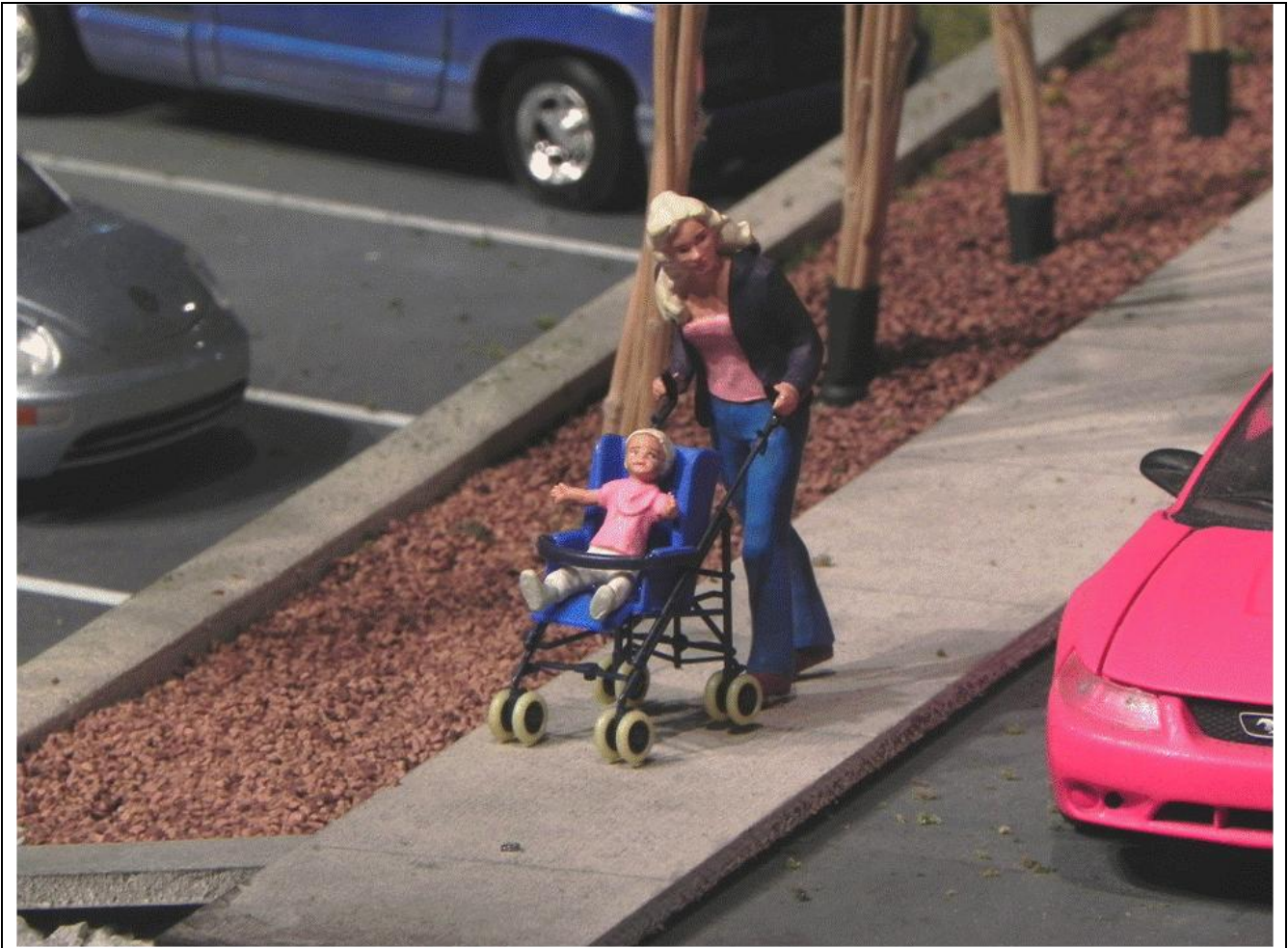
Figure 6. Stroller

On the street leading out of the Modern City (across the aisle from the in-layout restrooms), a young lady pushes a child in a fancy new stroller. Hope she's careful as she approaches the double-track railroad crossing, with its heavy train traffic.