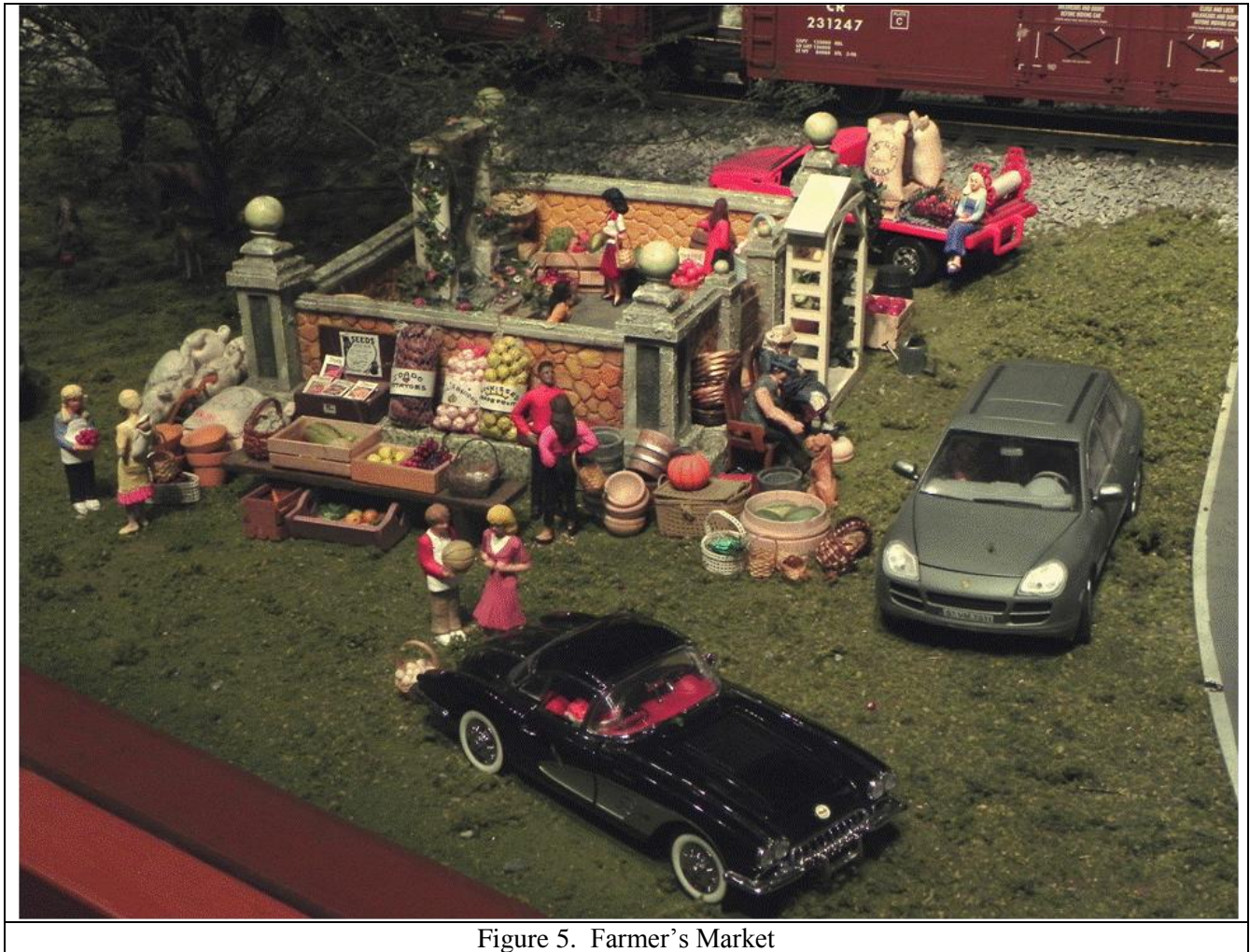
Figure 5. Farmer's Market

A bit farther along the aisle, the farmers' market, which has been on the layout for quite some time, has finally gotten some customers for the wide variety of produce that's available for sale there (Figure 5).