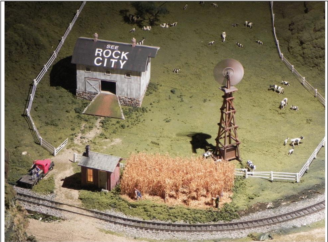
Figure 1. The Farm Below the Waterfall

The first selection is part of the farm below the waterfall (Figure 1). It's visible almost exclusively from the mezzanine. Distinctive features include the barn with its Rock City advertisement, a common feature of many barns in the middle part of the Twentieth Century. The small field of corn is being harvested by hand, and the stalks are bundled, awaiting being gathered for use as bedding for the animals. There is a windmill with blades turning. And, if you watch closely, you'll see the rotor change direction as though being driven by the weather vane to keep the rotor perpendicular to a changing wind. This is subtlety which requires a fair bit of engineering to accomplish in the model, and illustrates the attention EJ modelers pay to details of what they're modeling.