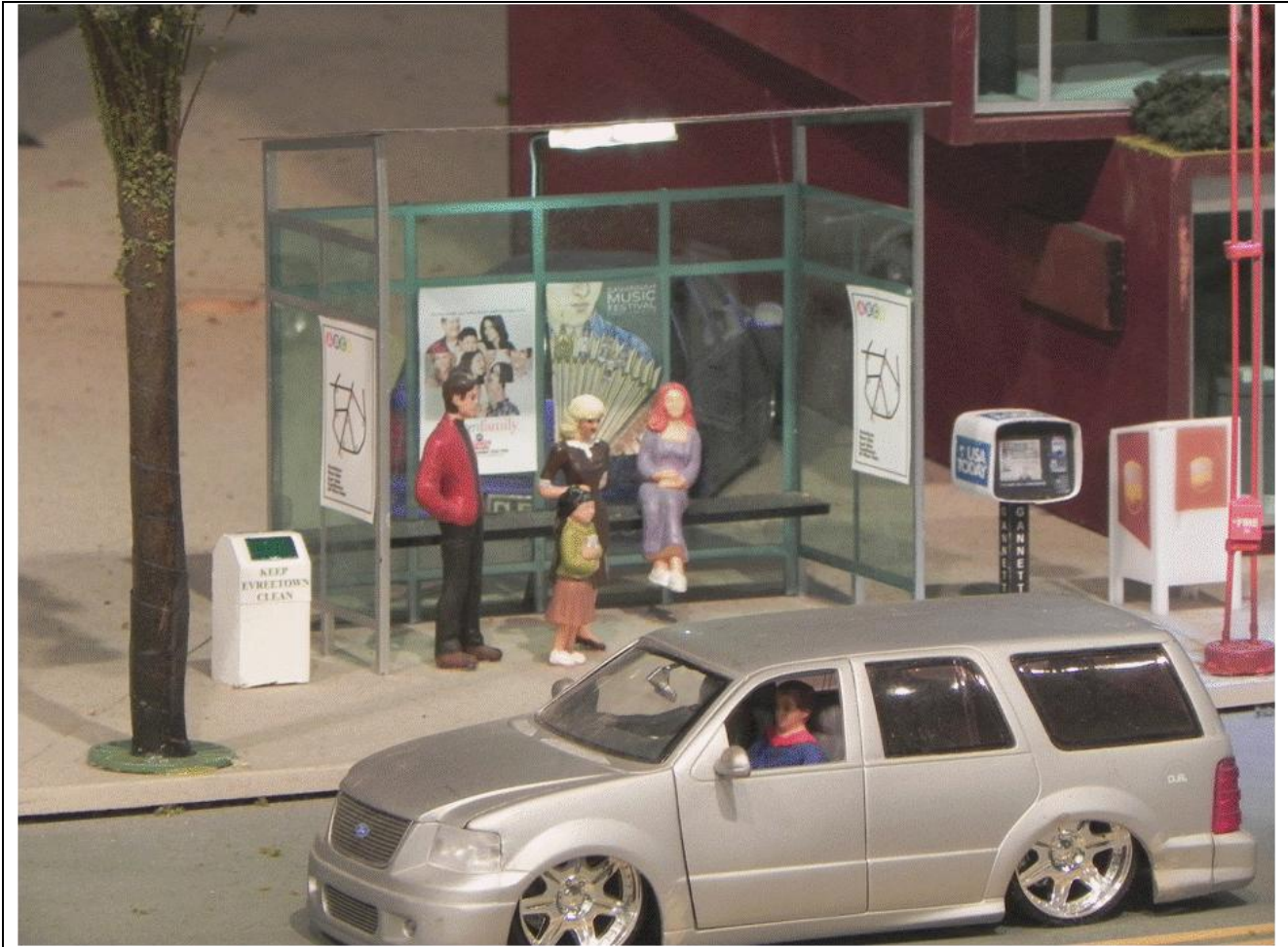
Figure 2. Bus Stop

In the Modern City, a common sight are the numerous well-lit bus-stop shelters (Figure 2). The one shown here has the usual complement of advertisements, bus-route maps, trash can, newspaper vending machine, and UPS drop box. There's also an assortment of passengers awaiting the arrival of the next bus (which is NOT the vehicle in the foreground!).