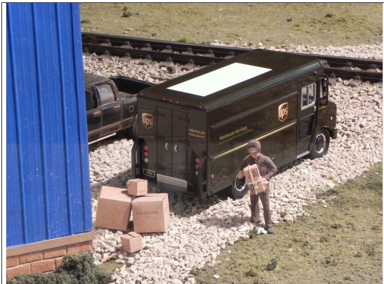
Figure 3. UPS Delivery

Across the aisle from the modern city, in the industrial area, a UPS deliveryman has unloaded a set of packages from a new and well maintained van for one of the trackside businesses (Figure 3).